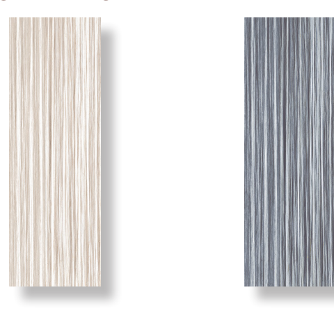
4" x 12" CERAMIC WALL TILE (Made in Italy)